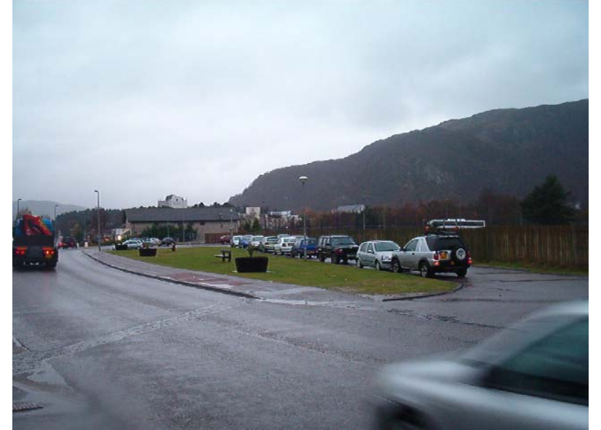
Fig 3. View south of site along Grampian Road