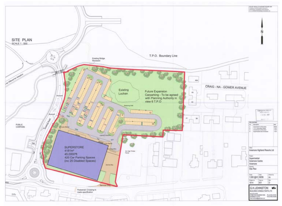
Fig 4. Indicative Site Plan of Proposed Supermarket